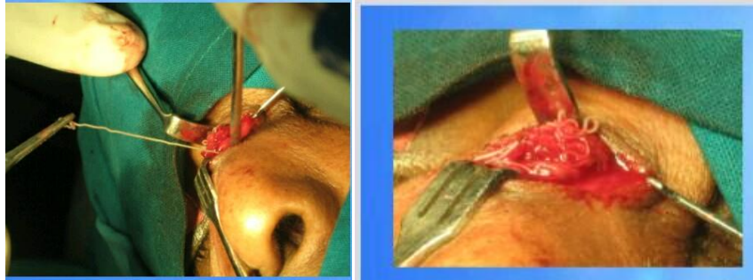
Fig 4 .Mass mass with larva

Mass removed in toto from the surface of the underlying muscle.