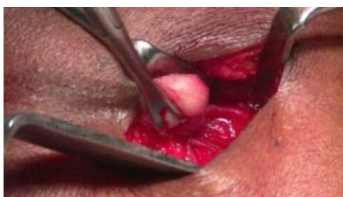
Fig 3. Encysted mass on dissection.

Local anesthesia was used at the site. Incision made over the swelling and blunt dissection done to identify the mass