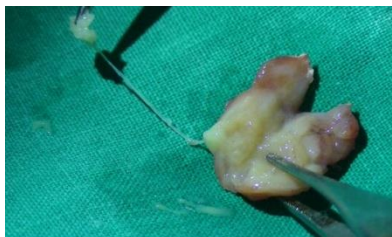
Fig 7.Cyst cut open with larva

Biopsy of the entire cyst with larva was sent for.