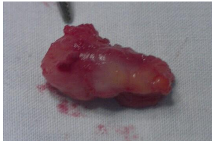
Fig 5.Cyst in toto

Mass removed in toto from the surface of the underlying muscle.