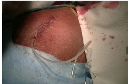
Fig 6.Suction drain and wound closure

Regular small sized suction drain was inserted and wound closed with 3,0 prolene .