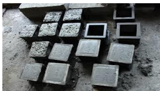
Fig. 4. Casting