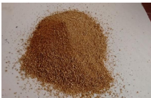
Fig. 3: Sand