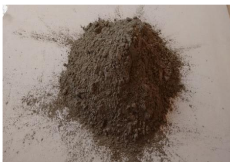
Fig. 1. Cement

The fineness of cement is 3%, specific gravity of cement is 3.13, standard consistency of cement is 31%, Initial setting time is 60 minutes and final setting time is 250 minutes.