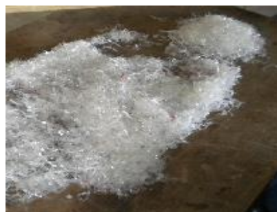
Fig.2:Waste PET bottle