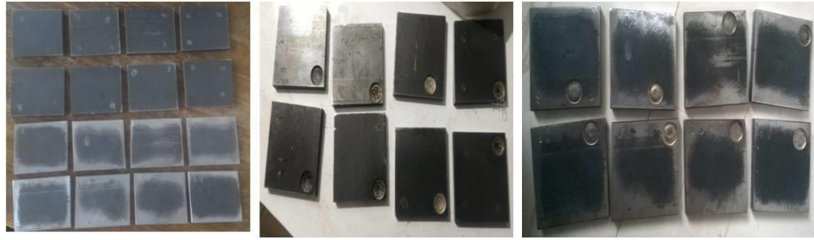
Figure 1: Samples before and after machining with both the tools