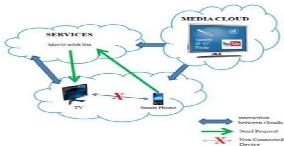
Fig.2.1 Multi Protocol Comatability with Cloud

In reality, if there are multiple radios on some nodes, it is most likely that these radios are heterogeneous. For example, a node can have an Ultra-Wide-Band (UWB) radio and an 802.11 radio, or an 802.11a radio and an 802.11g radio simultaneously many attractive and promising features of M3WN motivate us to consider how to efficiently leverage the feature of multi-radio and multi-channel to conquer/reduce the wireless interference that widely exists in classical multi-hop wireless networks. To effectively mitigate interference, both routing and channel assignment (CA) should be carefully designed. Here, routing selects the path from the source to the destination for connections, and thus assigns traffic to each radio and link, while CA determines the channel which a radio interface should use. Wireless broadband networks are being increasingly deployed in a multi-hop wireless mesh network (WMN) configuration. These WMNs are being used on the last mile for extending or enhancing Internet connectivity for mobile clients located on the edge of the wired network. Commercial deployments of multi-hop wireless mesh networks (WMNs) are already in the works. The deployed mesh networks will provide commercial Internet access to residents and local businesses. In WMNs, the access points (or mesh routers) are rarely mobile and may not have power constraints.